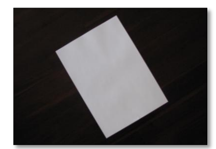
1. Start with a sheet of plain white paper. Fold top right corner down.

Tell the Resurrection Story with paper. Photos and suggested words have been provided by <u>www.missionbibleclass.org</u>. The source I used for the paper tearing idea is http://maryricehopkins.com/cross-with-one-tear/.