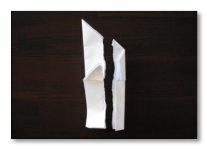
6. Tear in a straight line down the centre.